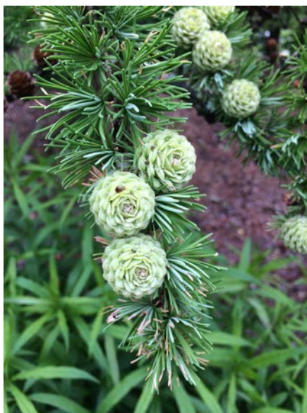
Larix decidua . Left: foliage; Right: form.

Larix decidua , or European larch, is a native to the mountains of central Europe that grows large (over 60 feet tall) with a pyramidal shape, horizontal branching, and drooping branchlets. As the tree ages, the shape can become more irregular. Needles turn a golden yellow in the fall before dropping, and come out in spring in cute tuft-like clusters. They are tolerant of some light shade, but intolerant of dry soils and pollutants. We have a native larch – Larix laricina , or the eastern larch, if natives are your thing. You can also find this, along with a weeping variety of L. decidua in the arboretum at the gardens.