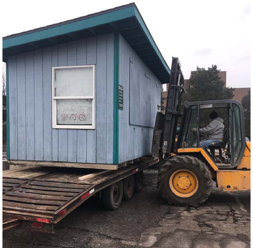
The old blue garden booth being taken away in January 2019 to make room for a new sidewalk and new booth!

The completion date for all of this work is scheduled for August 1st (fingers still crossed). So when you visit the gardens this summer be patient with parking. We are told that half of the lot will be accessible most of the time. If not, signage will redirect you to another nearby lot. All of us here are very excited for this new and updated parking lot and safe passageway walk to be completed. We hope you will be too!